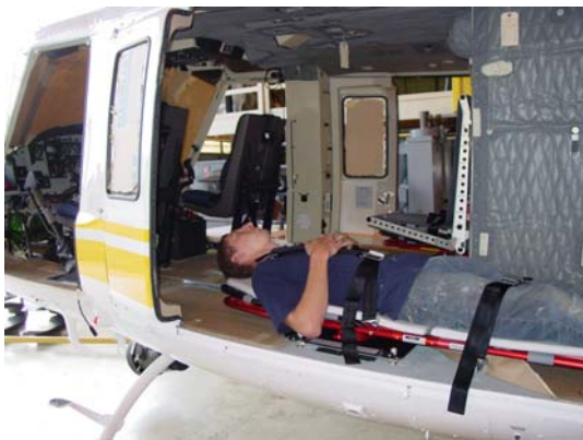
Rescue stretchers shown with utility seating